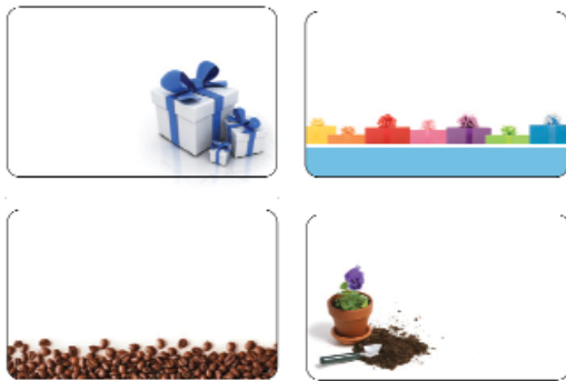
Standard Cards Samples

Your gift card transactions will be handled by Elavon with the same speed and ease of credit cards. This keeps your lines moving, even on the busiest days. Compare that to the hassle of manually processing paper gift certificates. Further, you'll have the advantage of